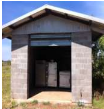
WITH DOOR OPEN