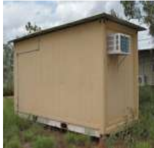
SIDE VIEW OF THE MORGUE