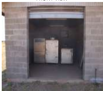
VIEW OF THE MORGUE SHOWING 2 X 2 CAPACITY & 1 X 1 CAPACITY FREEZERS