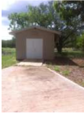
OUTSIDE VIEW OF MORGUE