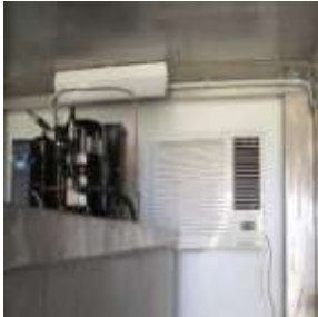
THE MORGUE'S AC & REFRIGERATION UNIT