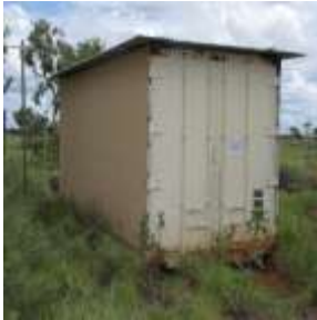
FRONT VIEW OF THE ALPURRURULAM MORGUE