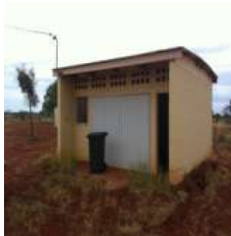
FRONT VIEW OF NYIRRIPI MORGUE