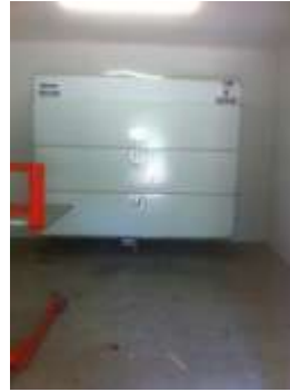
INSIDE VIEW 3 X BODY CAPACITY FREEZER