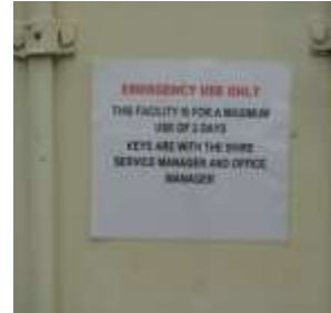
SIGN ON FRONT DOOR OF THE MORGUE